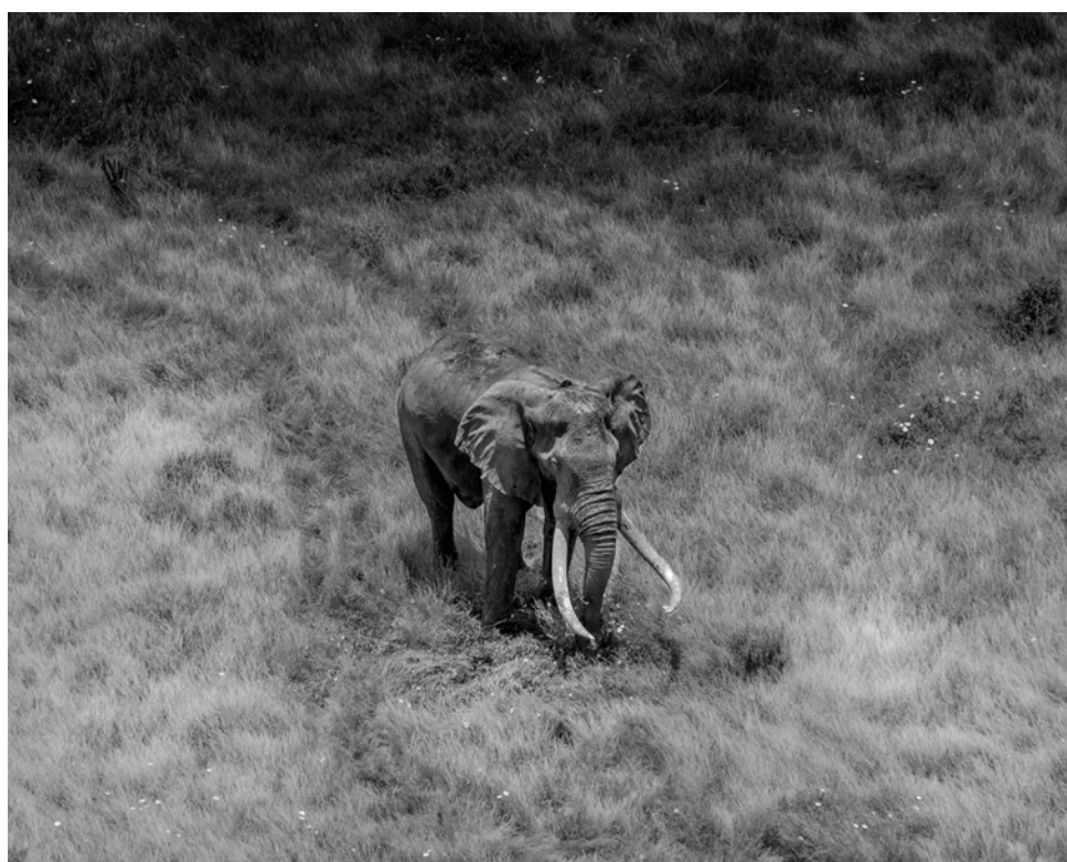
Photo shows Tusker coded as WS1 taken on 18 th March 2020, TENP.

WS1 is one of the 10 Super Tuskers that live in Tsavo today.