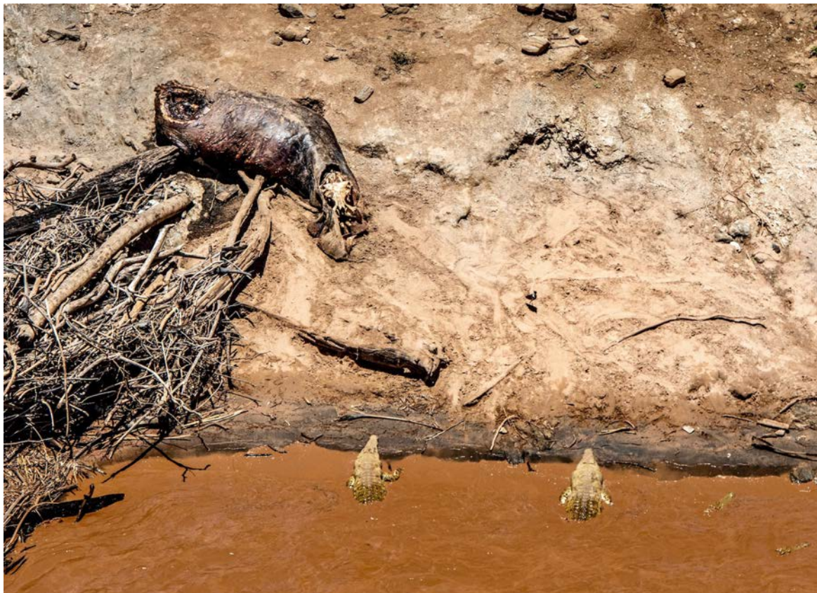
29 th March 2020; photo taken from the air, shows a hippopotamus having died naturally in a fight, along with several crocodiles lining up for a feast – TENP.

Covering: Air & ground activities; Big Tusker monitoring; Locating illegal activities; Wildlife monitoring; Aerial census and telemetry tracking.