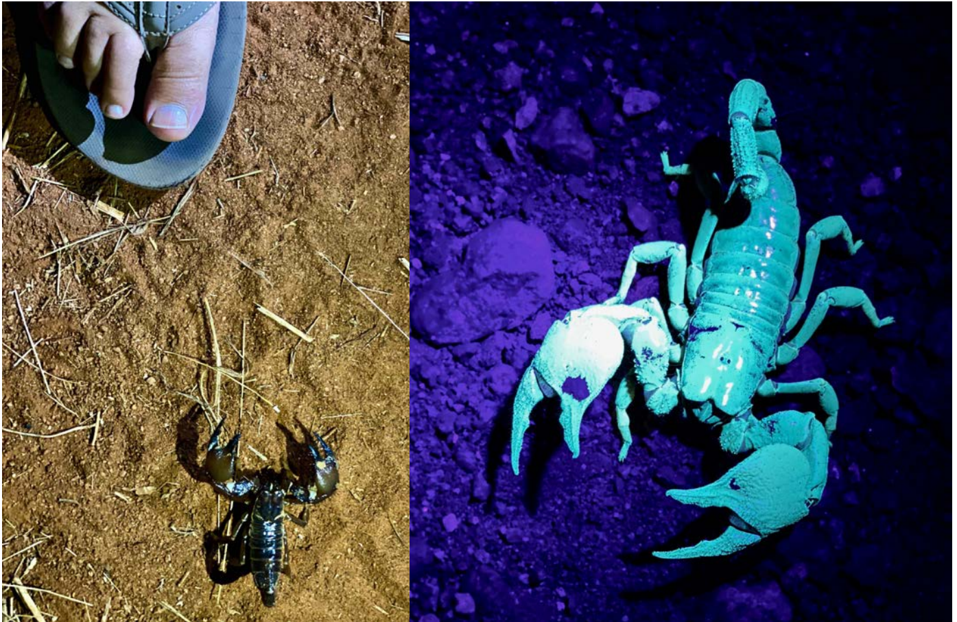
Photo on the left shows the scorpion in “white light” (normal torch light) and on the right the same scorpion in ultraviolet torch light. These scorpions can look quite dangerous and harmful but in fact they are placid and not as painful a sting as the many other types found here.

31 st March 2020: photo shows an Emperor Scorpion ( Pandinoides militaris ) taken at Tsavo Trust HQ. With the continued rains in this area, scorpions and so many other varied insects remain plentiful, especially at night.