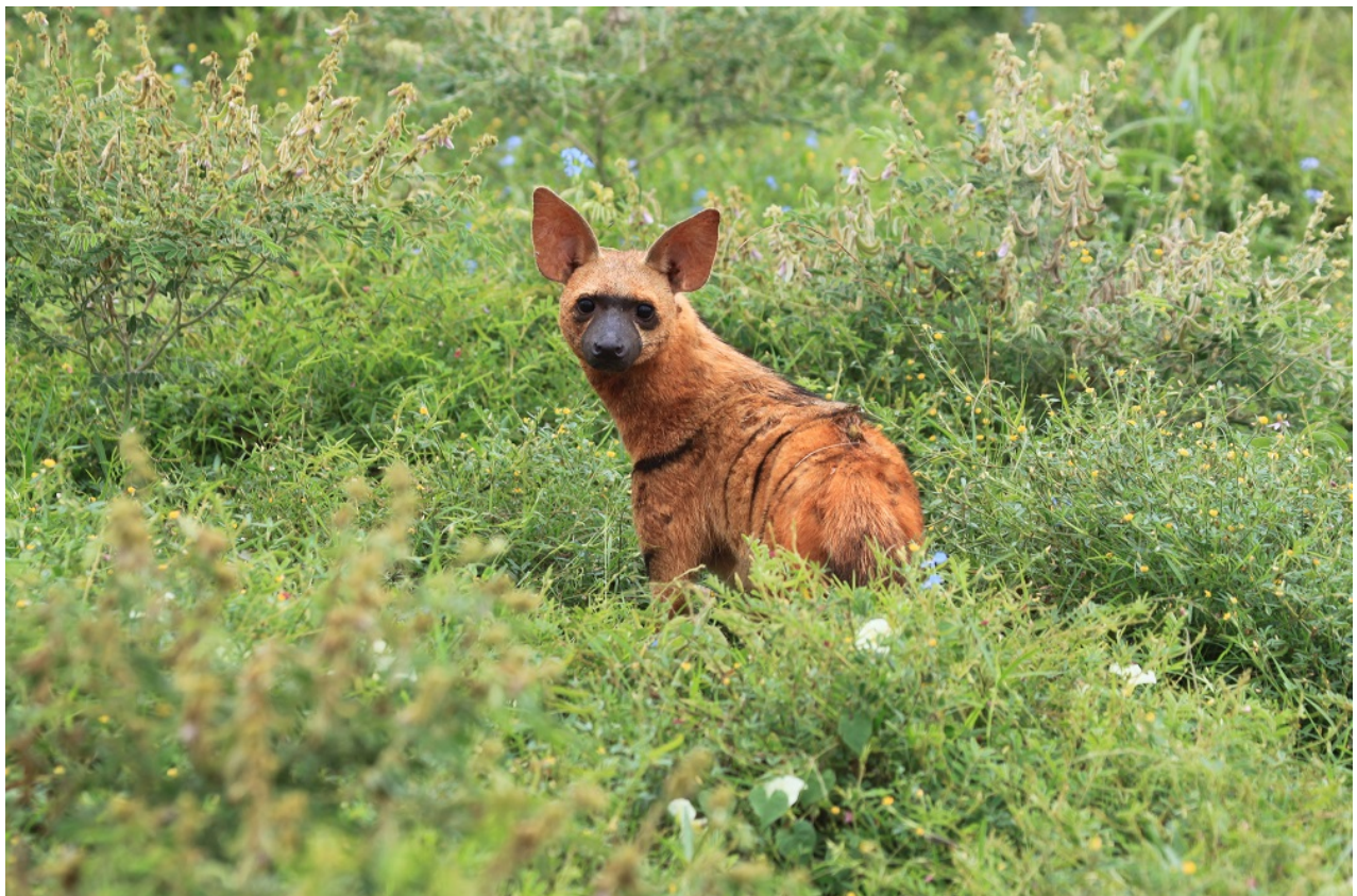
Photo of an elusive Aardwolf (Proteles cristata) taken in TENP on 17 th February 2020.

Covering: Air & ground activities; Big Tusker monitoring; Locating illegal activities; Wildlife monitoring; Aerial census and telemetry tracking.