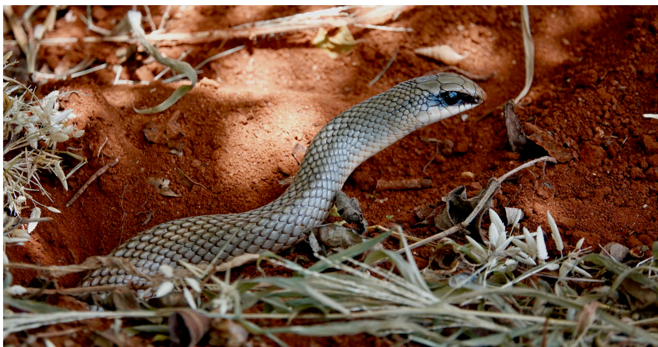
Photo of a Rufous beaked snake (Rhamphiophis oxyrhynchus) hunting for naked mole rats at Tsavo Trust HQ on 25 th February 2020.