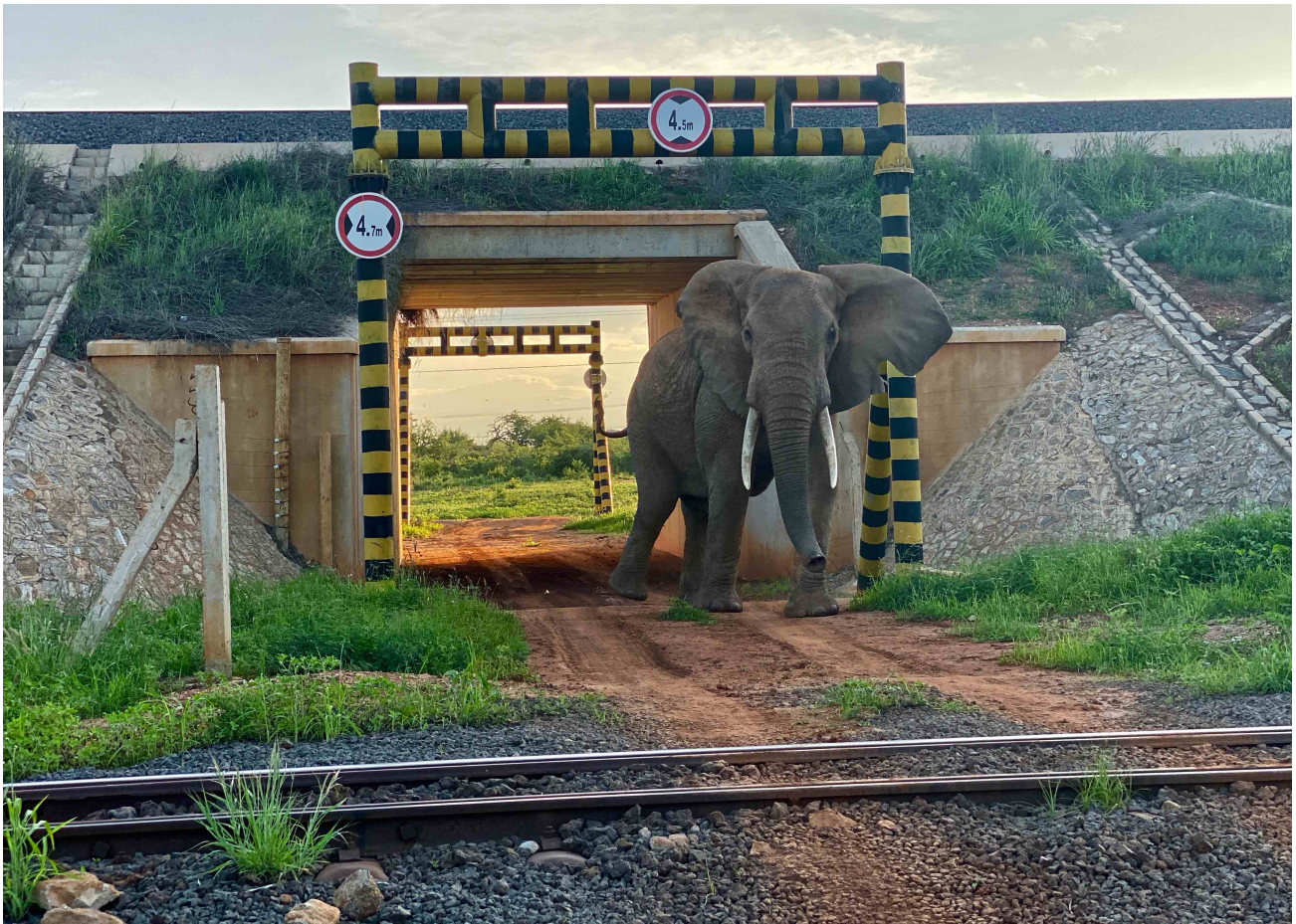
Photo taken on 27 th November 2019 at one of the SGR - vehicle under passes just south of Mtito Andei town. This small underpass is regularly used by varying wildlife to include elephants; buffalo; lion; leopard; hyena; impala and more. It clearly shows that wildlife does find a way to cross major infrastructure developments, as long as well-informed planning for wildlife movements is implemented during construction phases. This underpass is important for wildlife moving between main TWNP and the Tsavo Triangle.