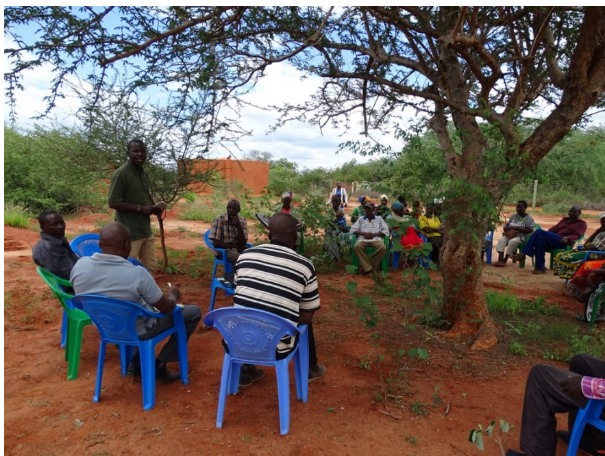
Photo taken on 9 th November 2019 at Ngiluni Village where VSLA training took place of several Kamungi Conservancy community members.

This is part of joint efforts by Tsavo Trust and ZSL to bring benefits to communities bordering the north boundary of TWNP between Chyulu Hills and Athi River.