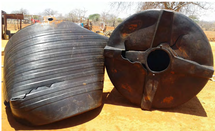
Photo shows 2 destroyed plastic water tanks in Ngiluni area of Kamungi Conservancy.

Elephants have created havoc in this region during the extensive dry season.