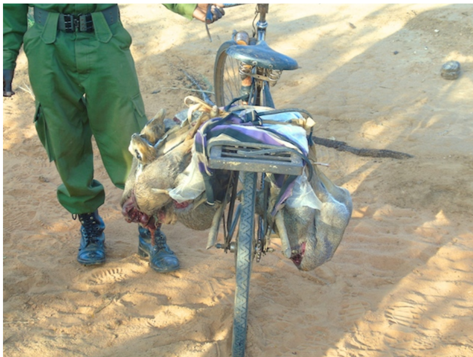
Photo shows 10 dikdiks having been poached on Dakota Ranch by poachers using the lamping method at night.

1 poacher arrested and his bicycle and other equipment confiscated by KWS/TT Tembo 1 team.