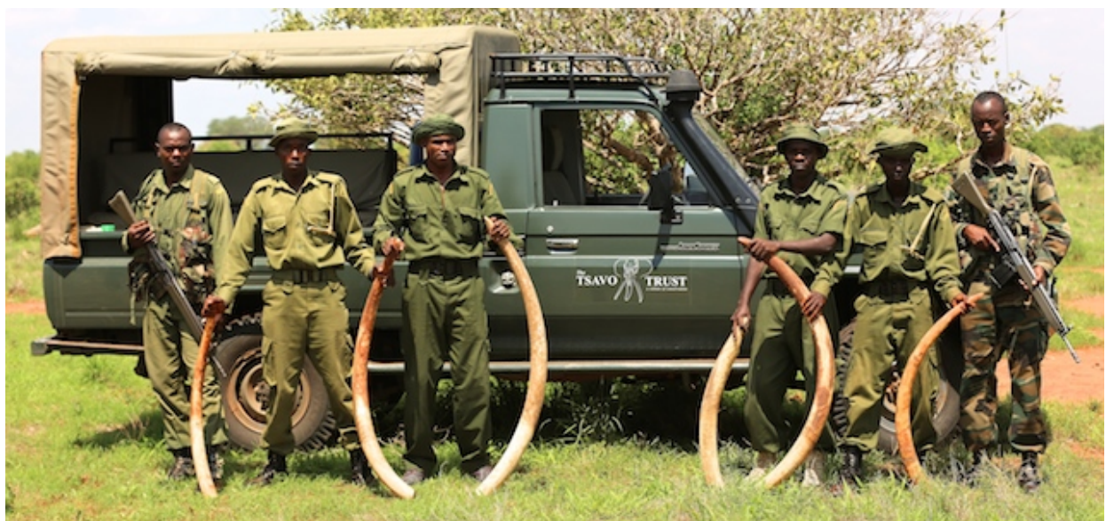
Photo below shows the joint KWS/TT mobile TEMBO 1 Team, having recovered 6 elephant tusks on their very first day of operations on 15 th December 2016 in Tsavo East Nat. Park. These elephant carcasses were found during an aerial reconnaissance flight and then the TEMBO 1 team was deployed to verify cause of death and recovery the ivory before they fall into the “wrong hands”. All were natural deaths.