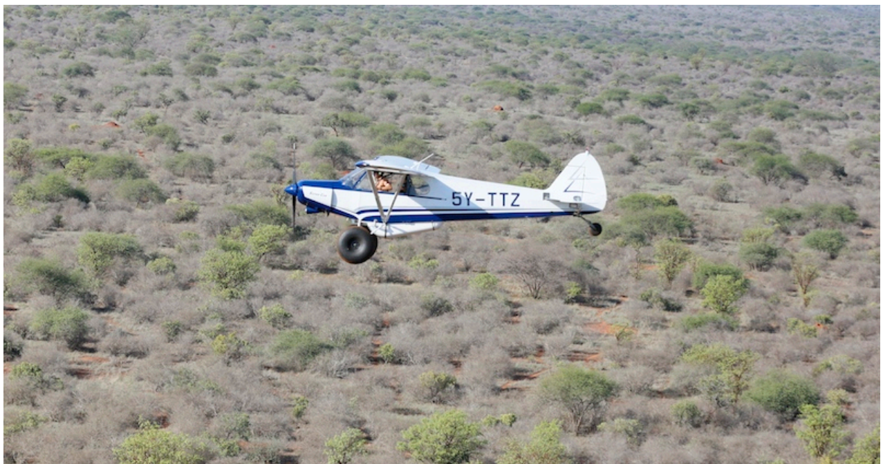
Photo below shows Tsavo Trust Super Cub 5Y TTZ during TCA Aerial Census in February 2017.

Although official figures have not been released yet by KWS, the indication is that the elephant population of Tsavo is on the increase, which is a real positive.