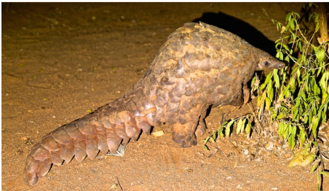
Photo below shows a rescued ground Pangolin on 6 th February 2017. She was rescued from Galana Ranch and observed over night and free released in TENP along the same watercourse on 7 th February.