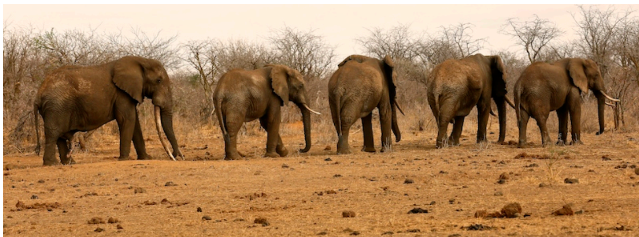
Photo below shows Kamboyo (far left) with 4 askaris (body guards) leaving a TW water hole in September 2016.