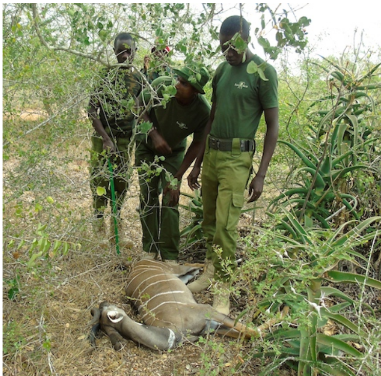
Photo shows joint KWS / TT Tembo 1 team having found a freshly poached lesser kudu in a snare on Giriama Ranch on 10 th February 2017.

Another 2 kudu were found in snares on the same day and 10 snares recovered.