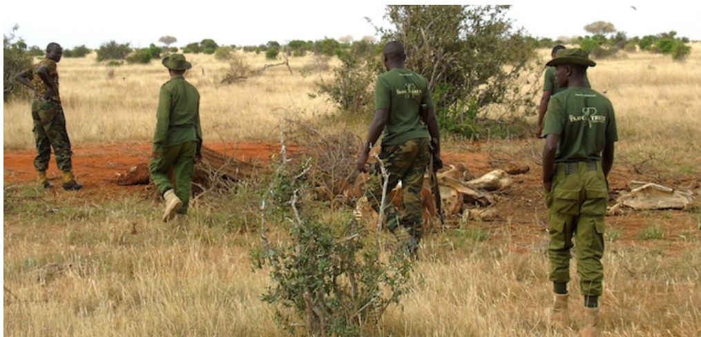
Photo shows Tembo 1 team inspecting an elephant carcass found during an aerial recce in the southern sector of TENP.

Another 2 kudu were found in snares on the same day and 10 snares recovered.