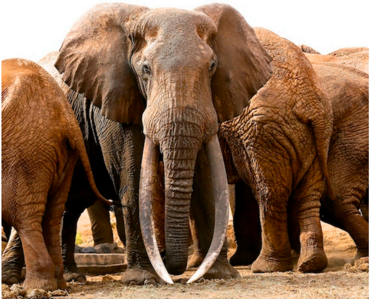
Photo below shows iconic Tusker called Kamboyo taken on 5 th July 2016 in TWNP.

Although Kamboyo will be sorely missed, the bright side of this story is that Kamboyo lived to a ripe old age of at least 55 years and he would certainly have spread his impressive ivory genes over that time frame. In todays modern elephant world where elephant poaching for ivory, human elephant conflict, drought, livestock invasions and so on takes the head lines, it is very unusual for any elephant to die naturally of old age, and especially one that carries such magnificent ivory. This example clearly shows that something is being done right and the joint efforts of KWS and Tsavo Trust's Big Tusker Project is indeed showing positive results in both regularly monitoring and helping to secure these rare and iconic elephants through aerial surveillance – eyes in the skies and mobile ground teams – eyes and ears on the ground.