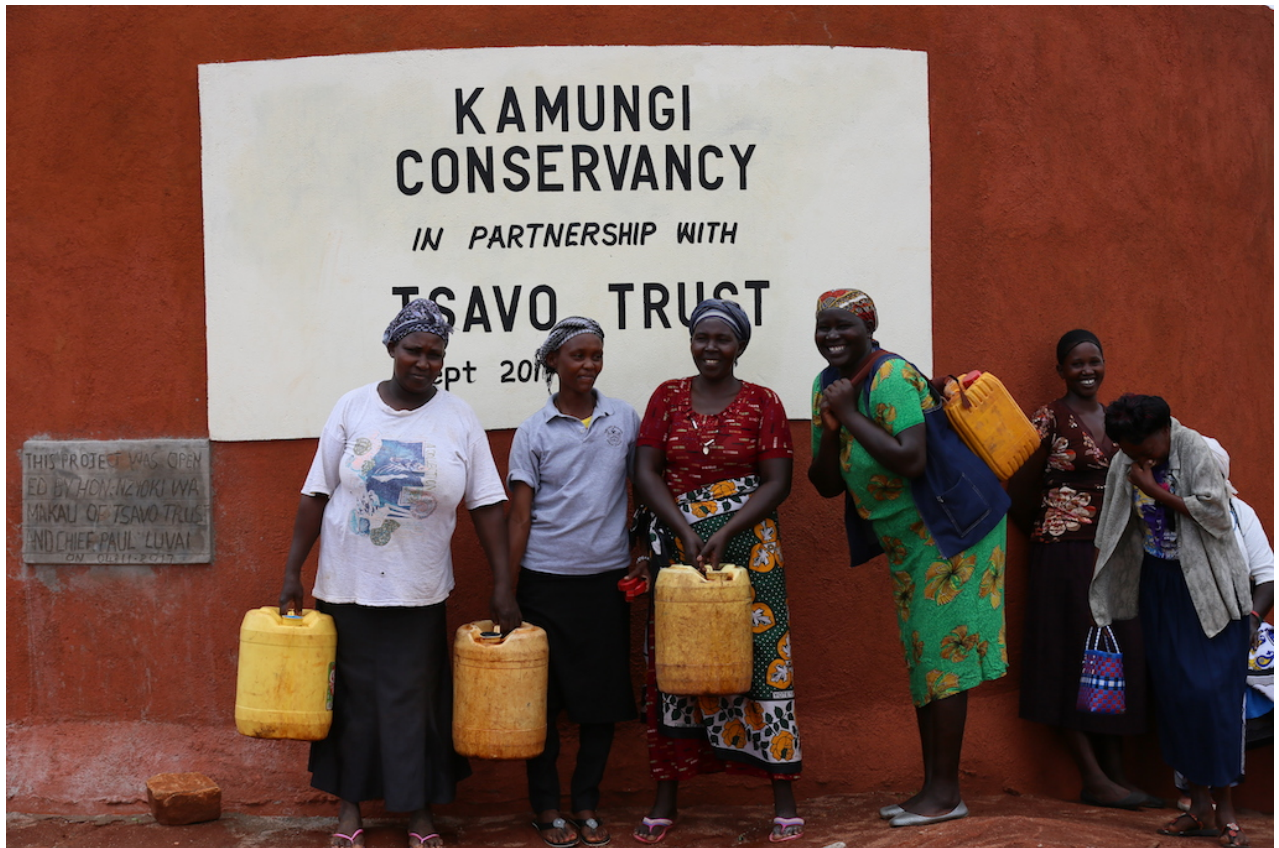
Photo below shows ladies collecting water from the Kamungi Conservancy 100,000ltr water tank in back ground. The local inhabitants of Ngiluni village are now saved many kilometers of walking to get water for domestic use as they once had to do. This supply is clean water and not unhygienic as was the case before this joint Kamungi Conservancy / Tsavo Trust project began.