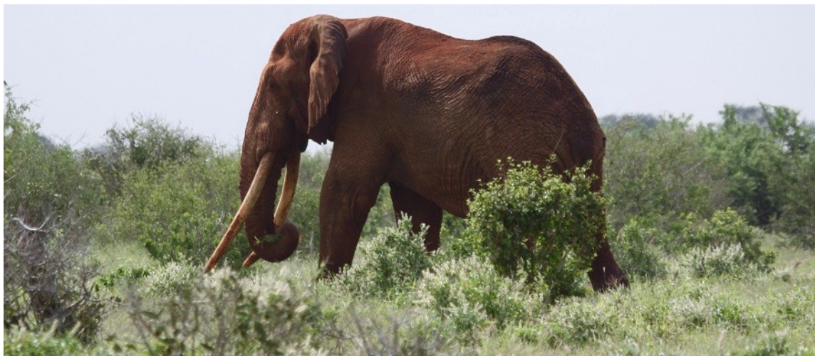
Photo below shows newly identified emerging “Tusker” on 21 st November 2017 coded as GO1.