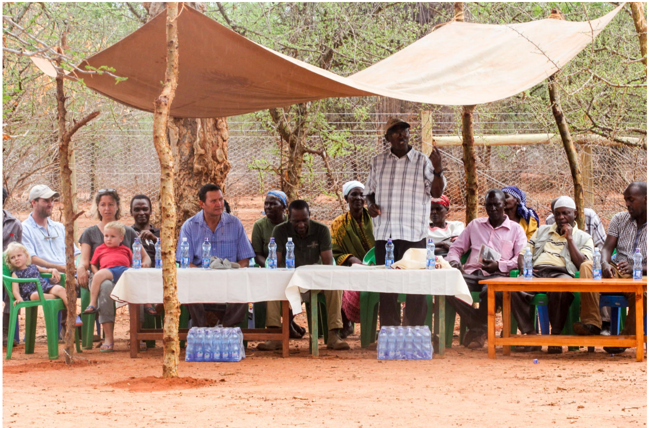
Photo shows the Kamungi Conservancy Chairman speaking to community members and the opening ceremony of the Kamungi Water Project on 4 th November 2017. This project consisting of a bore hole, solar pumping station, 2.5-kilometer pipeline to Ngiluni Village, 100,000 litre water tank and dispensing kiosk was put in place by Tsavo Trust to support the community members of Kamungi Conservancy that borders onto TENP.