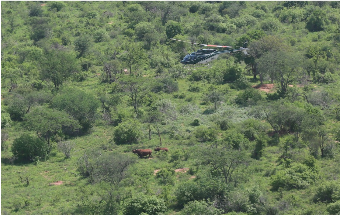
Photo below taken on 21 st November 2017 during the KWS / ZSL rhino capture exercise where Tsavo Trust played a support role with fixed wing aircraft for 48 hours flying covering 3,603 miles and also one 4 x 4 vehicle and Tembo 4 team as ground support.