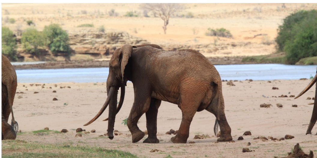
Photo shows newly identified emerging bull Tusker coded as SO1 in TENP.