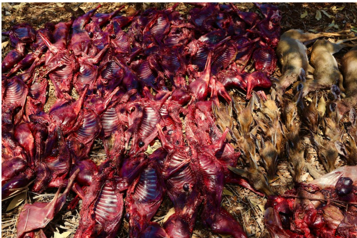
Photo below taken on 18 th September 2017, shows 25 freshly poached dikdikis confiscated from an arrested poacher by the joint KWS / Tsavo Trust Tembo 3 team who regularly operate along the TENP northern boundary (Triangle area). Half a dikdik carcass sells for just Ksh. 200 or US$ 2.