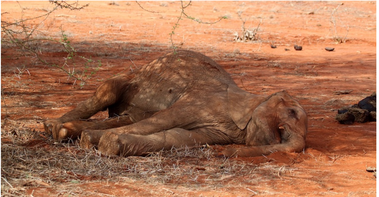
Photo below shows a fresh elephant carcass, with ivory intact (later recovered by joint KWS / TT Tembo I team) being fed on by lion, on 8 th September 2017. Lion prides have noticeable increased in size in recent months with plentiful fresh elephant carcasses to feed from, as a result of the severe drought that Tsavo East is facing. Tsavo lions are well known for preying on juvenile elephants and this is compounded during drought months when elephants are weakened. 21 carcasses were located in September alone and 38 tusks recovered jointly by KWS / TT teams.

Photo below taken on 29 th September 2017 in TENP, showing one of the many juvenile elephant calves that were found to have succumbed to drought between the Kanderi to Aruba section of Voi River. 70% of elephant mortality observed in TENP in September 2017 occurred in close proximity to the man-made water points, where desertification of surrounding habitat is clearly visible and taking its toll!