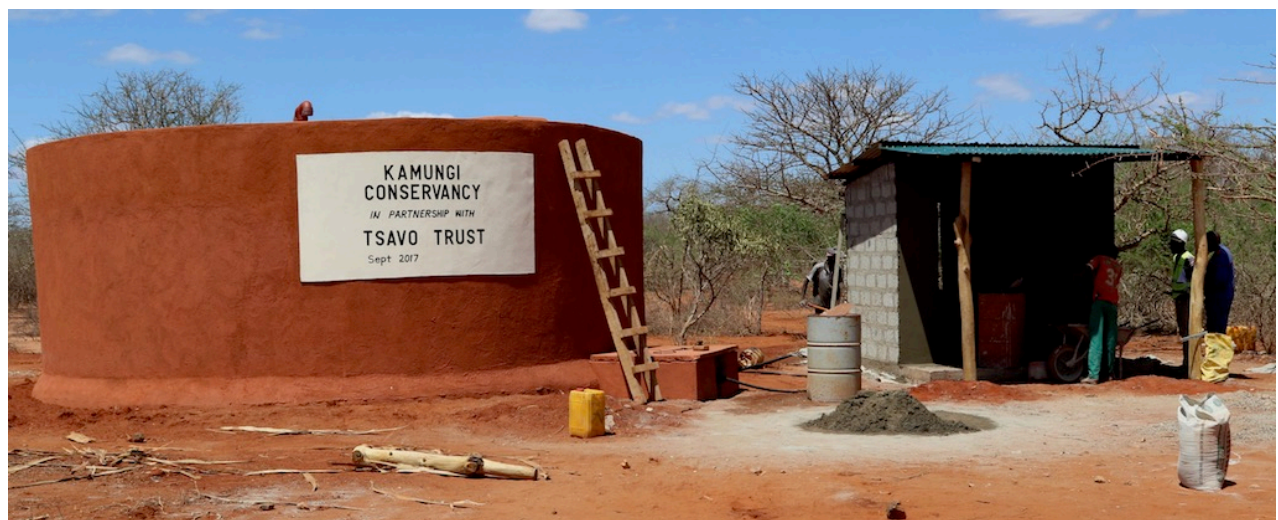
Photo shows Kamungi Conservancy 100,000ltr water tank and dispensing “kiosk” under construction.