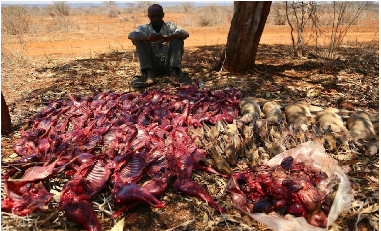
Photo of 1 arrested bushmeat poacher with 25 freshly poached dikdik on 18 th September 2017 by joint KWS / TT Tembo 3 team (Kamungi Scouts) along the northern border of TENP – Triangle area.