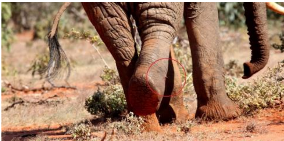
Photo taken by Tembo 2 monitoring team on 27 th July 2017 of an injured elephant with an arrow head in his lower right foot. This elephant was close to the southern boundary of TENP and it is likely the elephant came from crops outside of the Park. KWS Vet Unit alerted and the arrow head removed.