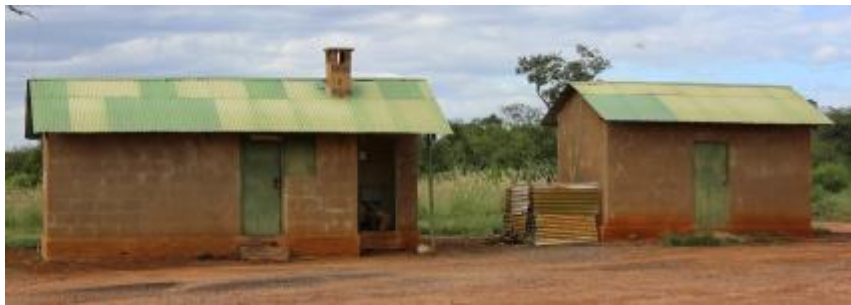
Photo below shows the Kamboyo airstrip building before renovation on 1 st June 2017