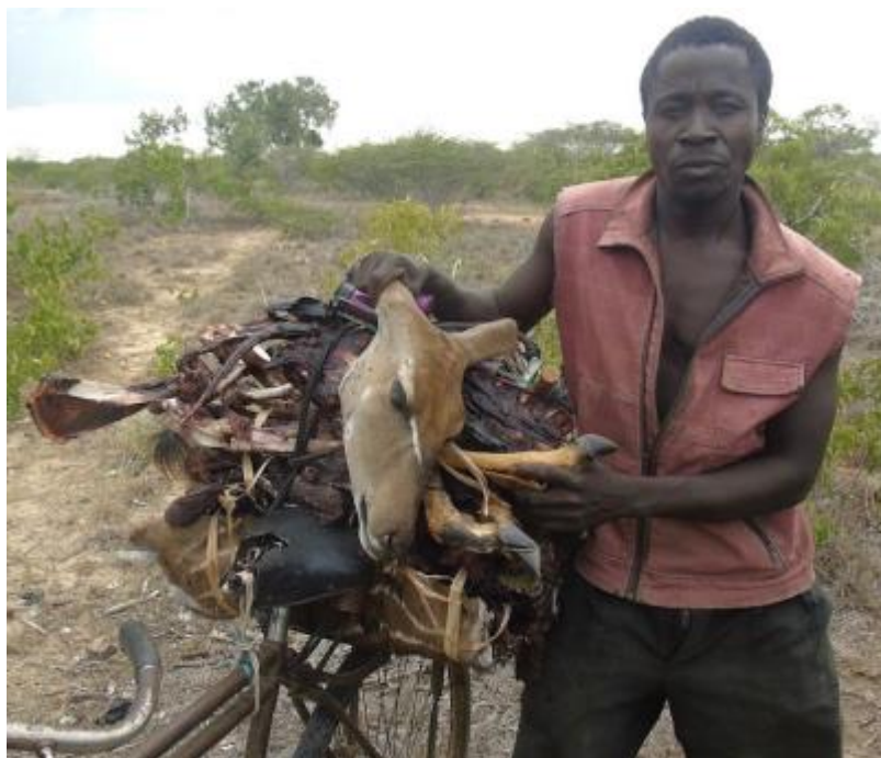
Photo shows a bushmeat poacher arrested with 2 poached lesser kudu by Tembo 1 team on 8 th July 2017 on Giriama Ranch outside TENP, southern boundary.