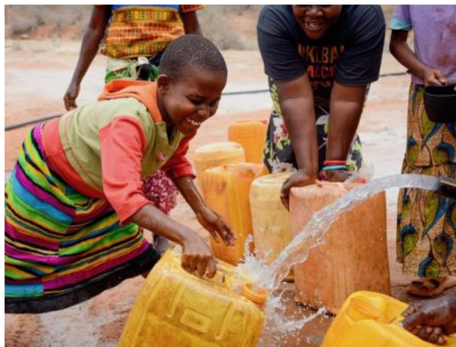
Photo below shows members of Kamungi Conservancy, located on TENP, Triangle northern boundary, enjoying clean water for the first time on tap. Tsavo Trust helped set up Kamungi Conservancy in 2014 and continues to play the pivotal stewardship role in its future development. Here, through donor funds raised by Tsavo Trust, a borehole, solar pump & panels, 2.5-kilometer pipeline and more are now in place. As a result of this project, already illegal activities such as bushmeat poaching and charcoaling have ceased to be a common threat along this section of TE National Park.