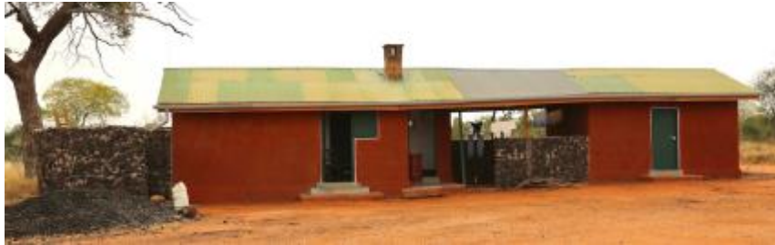
Photo below shows Kamboyo airstrip building after renovation on 20 th July 2017