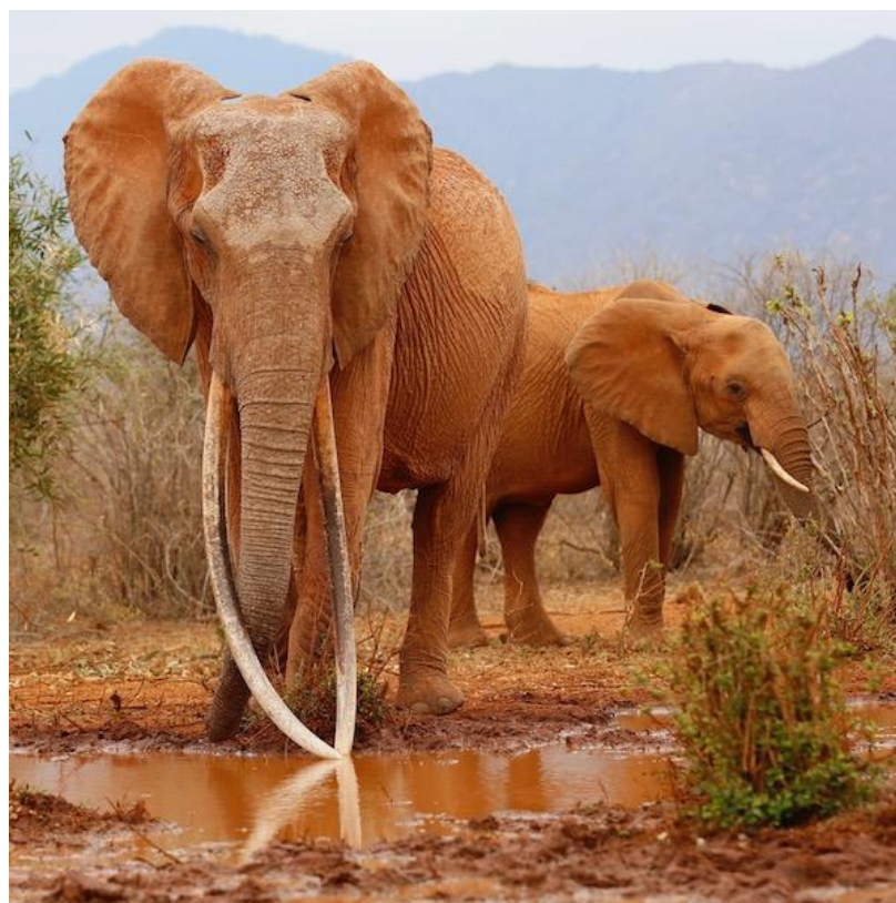
Photo shows one of Tsavo's iconic cow Tuskers coded as F_MU1 on 22 nd July 2017, TENP, along with her calf.

Tsavo Trust has known F_MU1 well for 4 years now. She must be at least 50 plus years of age now and in her twilight years.