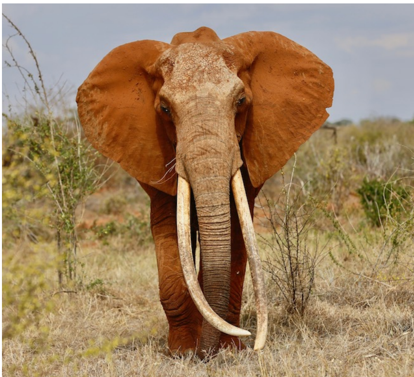
Photo shows one of Tsavo's magnificent and iconic cow Tuskers coded as F_MU1 on 20 th June 2017, TENP.

She is looking very old and it remains a big worry if she will pull through this dry spell over the next 4 months?