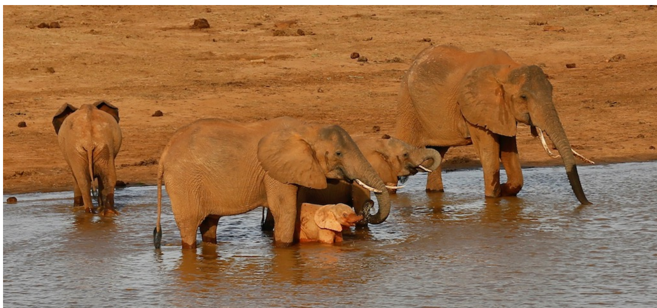
Photo below shows what appears to be an albino male elephant calf with his mother on 20 th June 2017 in TENP at Mudanda water hole. Certainly, his skin colour and pigmentation is very different and pink in colour that resembles an albino elephant – a sight rarely seen.