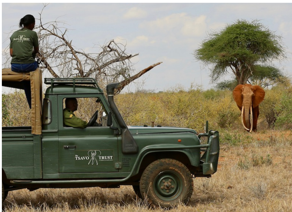
Photo shows Tembo 2 field monitoring unit observing one of Tsavo’s iconic cow Tuskers coded as F_MU1 in TENP on 20 th June 2017