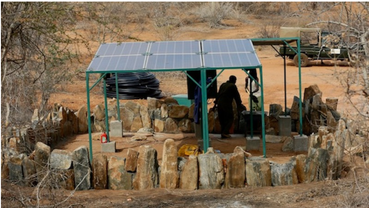
Photo below shows Kamungi Conservancy bore hole pump and solar power system, funded through Tsavo Trust by its supporters. A stone wall is being built around this unit to help protect it against elephants. This water source for the local community could not be more timely given the continual droughts that this area experiences. It will help to create awareness within Kamungi community and with this create a protective “buffer” to the TENP that forms Kamungi’s southern boundary.