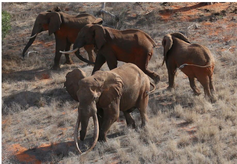
Photo of the elusive Tusker coded as BA1 on 23 rd October 2018.