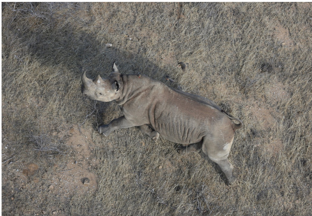
Photo shows a TWNP IPZ black rhino in fine condition on 2 nd October 2018. In support to KWS Rhino Program and in partnership with ZSL, Tsavo Trust carries out aerial tracking of rhino fitted with transmitters on a regular basis.