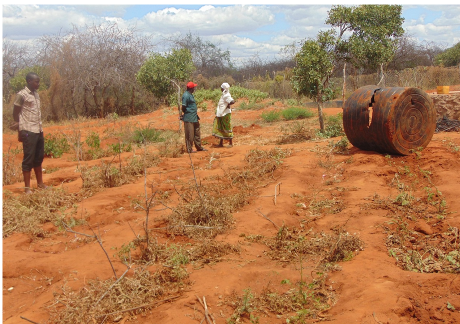
Photo shows crop damage by marauding elephants in the Ngiluni village area in early October 2018.

The plastic water holding tank was also totally destroyed.