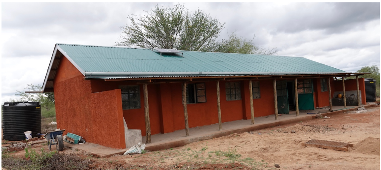
Photo shows Ngiluni Dispensary upgrade project on 29 th October 2018, with new green corrugated iron roof, verandah and rain water catchment facilities being added. Inside has been fully painted and new ceiling boards put in. All holes for roosting bats and nesting birds, lizards and rats have been filled in.