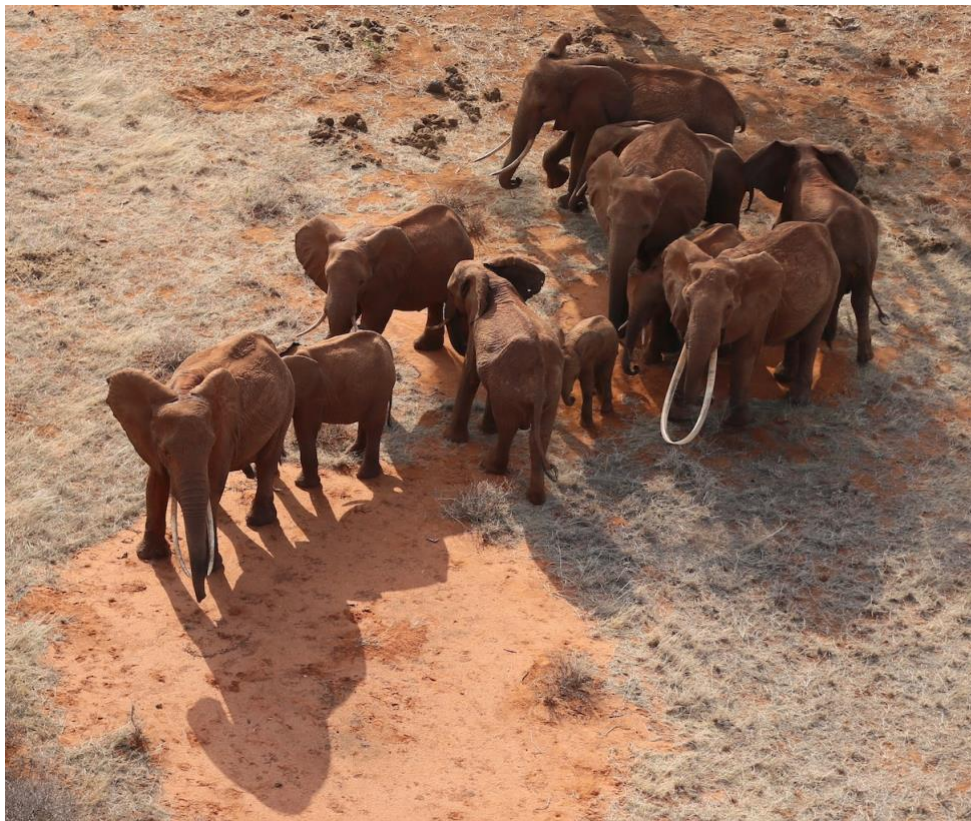
Photo shows iconic cow Tusker coded as F-DII in TENP on 22 nd September 2018.

She had not been observed since 12 th March 2018.