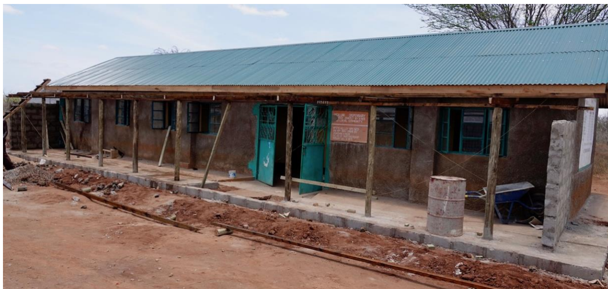
Photo shows Ngiluni Dispensary upgrade project on 9 th September 2018, with new green corrugated iron roof and verandah being added. This will enable catchment of rain water.