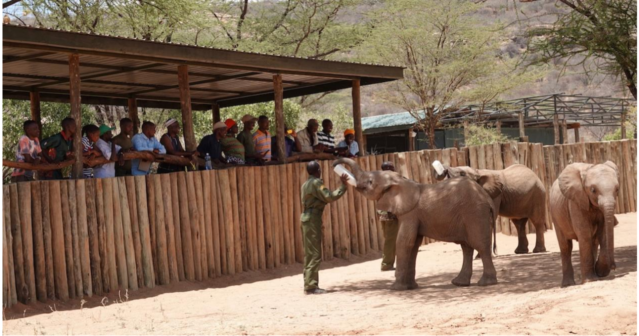
Photo shows the Shirango community team of 11 members viewing orphaned elephants at Northern Rangelands Trust – Namunyak Conservancy / Reteti Elephant Sanctuary. The Shirango team learnt a huge amount from NRT and LWC during their exposure tour, that was funded by USAid. A big thank you to NRT and LWC for sharing their knowledge with this team.