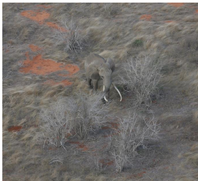
Photo shows one of Tsavo’s emerging Tuskers coded as SH1 on 1 st September 2018, TENP.

SH1 is very close to being elevated into the Super Tusker category given the size and length of his ivory.