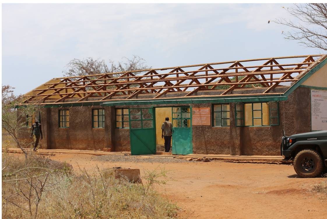
Photo shows Ngiluni Dispensary upgrade project on 27 th August 2018, with old asbestos roof removed ready for new green corrugated iron roof to replace. This will enable catchment of rain water.