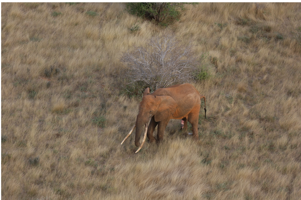
Photo shows one of Tsavo’s better emerging Tuskers coded SO1 on 26 th August 2018.