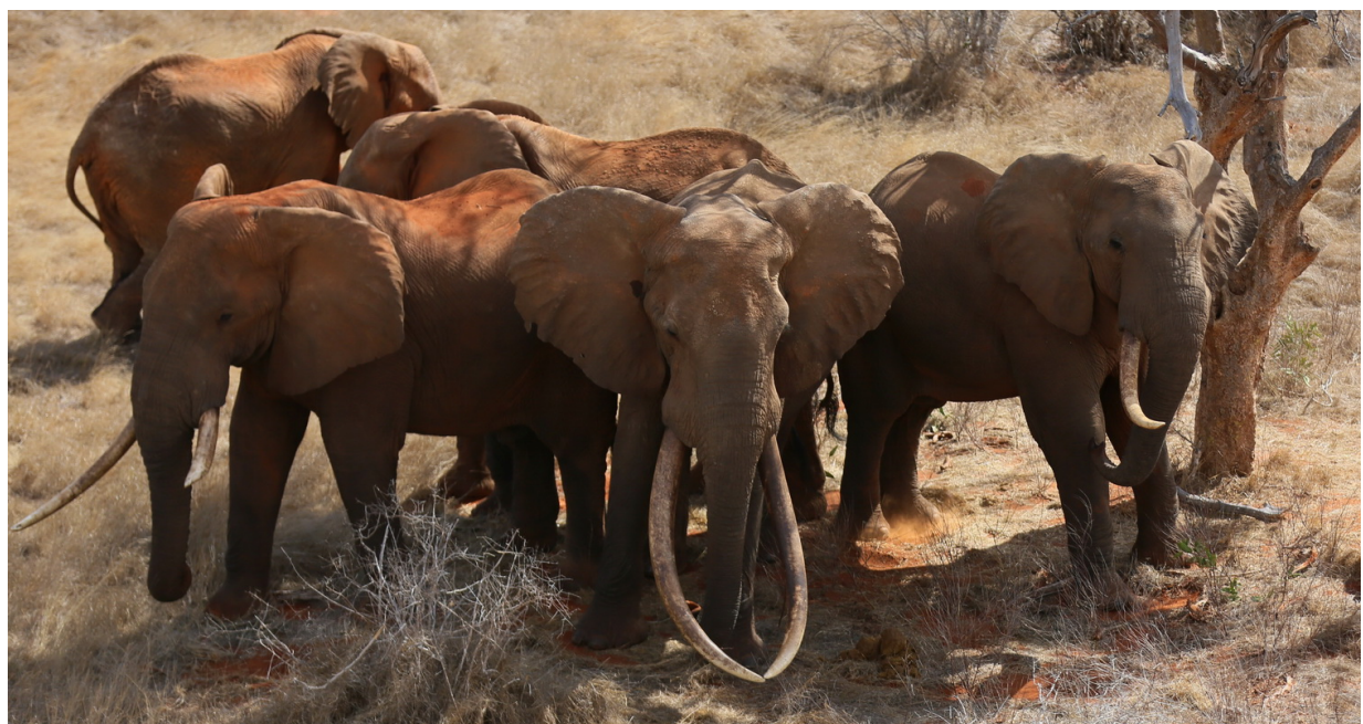
Photo shows Super Tusker coded as BA1 on 26 th August 2018. BA1 has been lost for 13 months and was last seen in July 2017, 110 kilometers from this sighting! A big relief he is still alive.