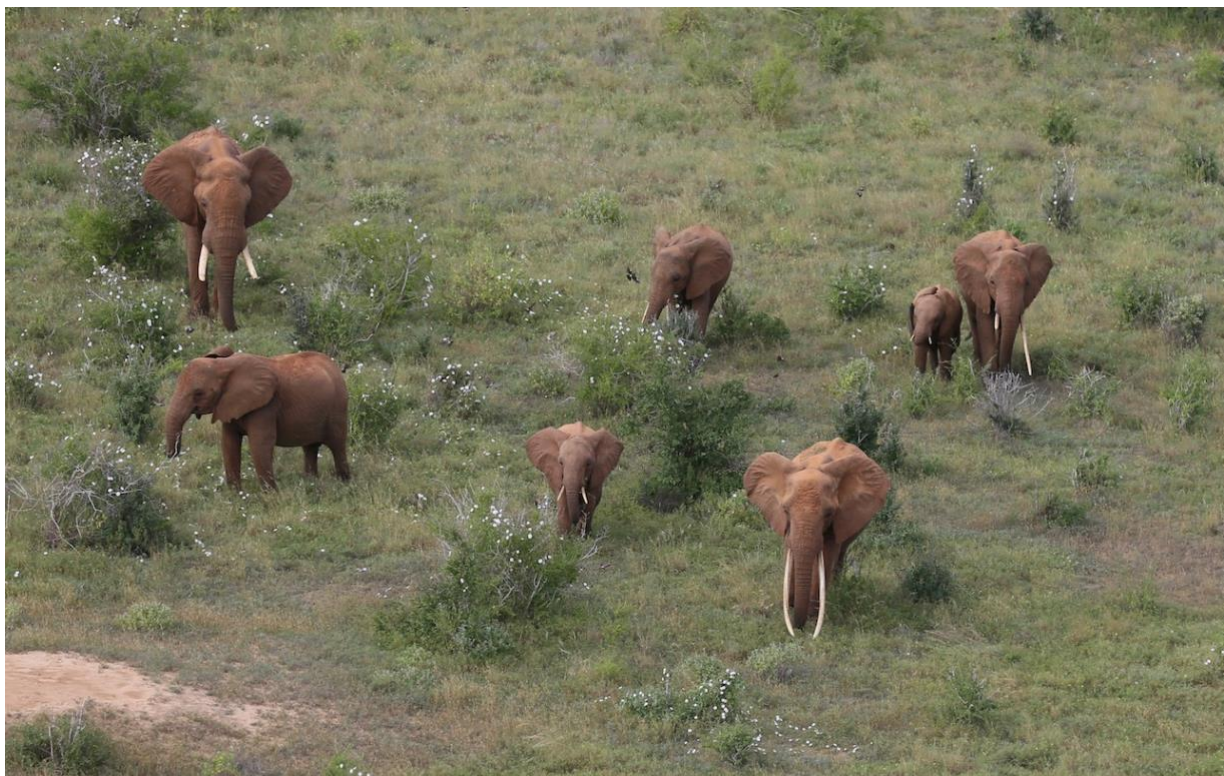
Photo shows a newly identified Cow Tusker coded as F-SG1 in the foreground on 6 th May 2018. Tsavo continues to surprise everyday with yet another unknown iconic Tusker.