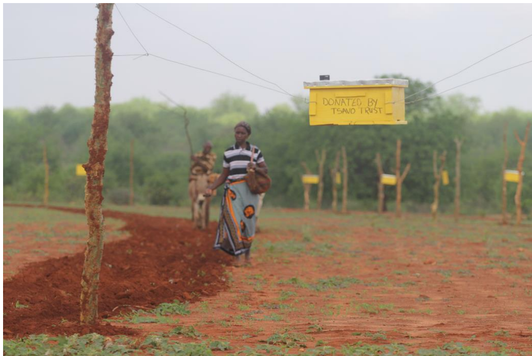
Photo shows one of 5 Bee Hive Fences within Kamungi Conservancy that have achieved considerable success with Human Elephant Conflict since set up.