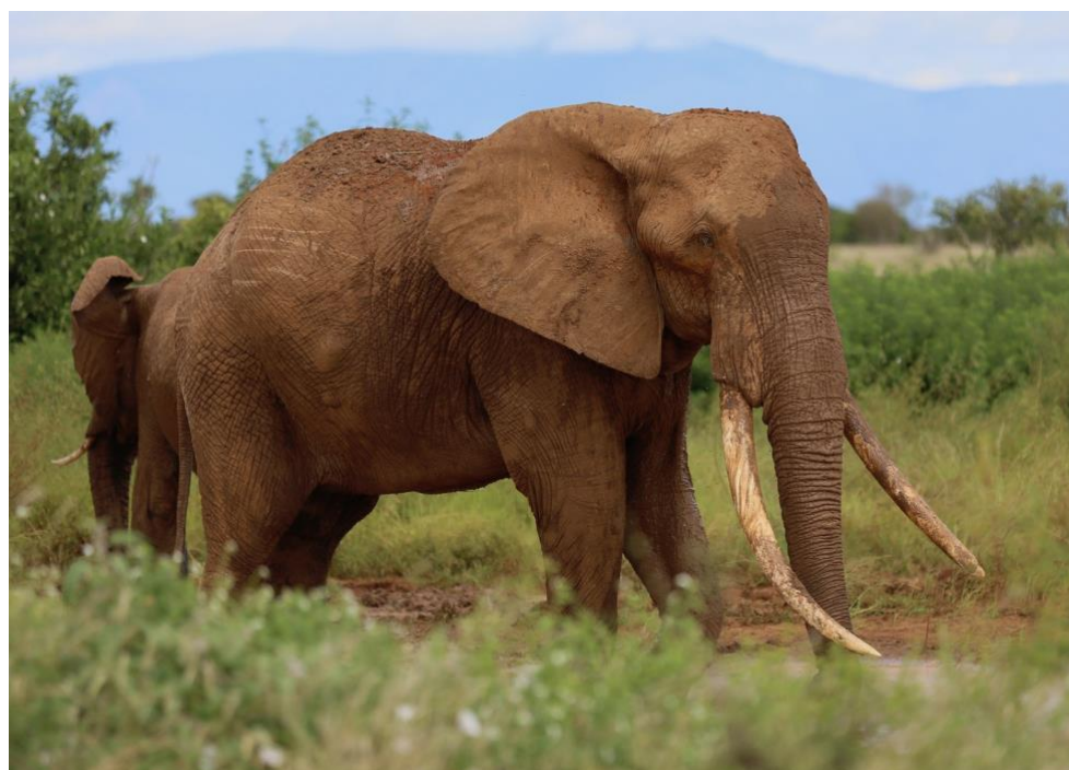
Photo shows emerging Tusker coded as KM2 on 12 th May 2018.