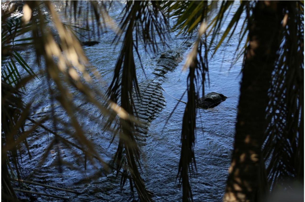
Photo showing a well concealed crocodile looking like a submerged log under the shade of some Doum palms at Mzima Springs in TWNP on 28 th May 2018.