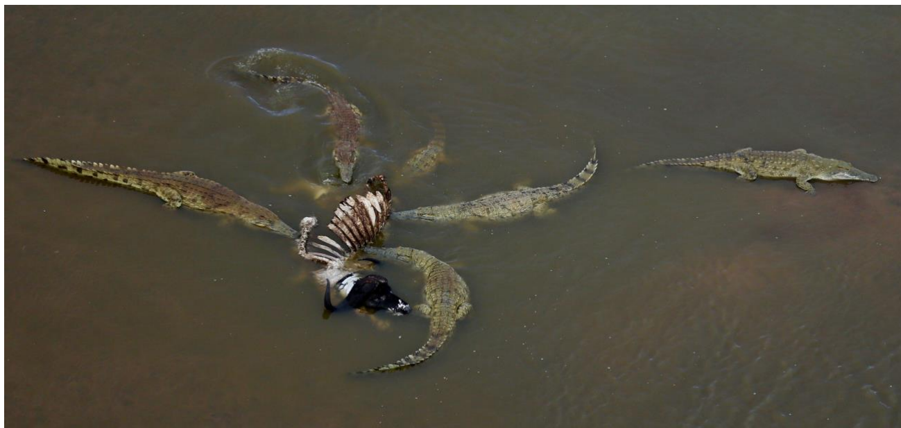
Photo of 6 large crocodiles feasting on an adult buffalo carcass on 2nd August 2019, in the Galana River, TENP.