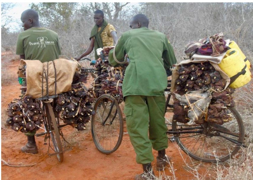
Photo shows 100kg of recovered dried bushmeat on 29 th August 2019 just outside the southern boundary of TENP.

Joint KWS / TT Tembo 1 team have been active along this section.