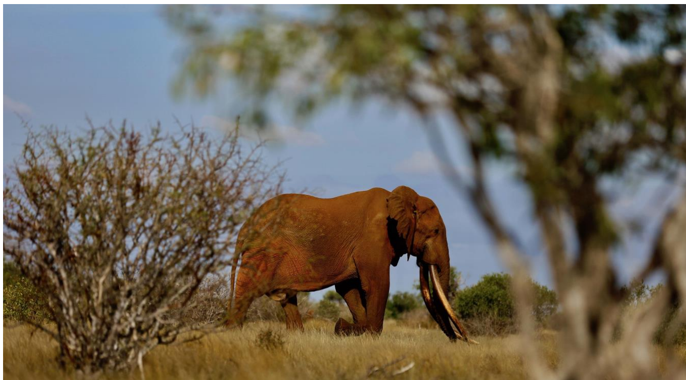
Photo shows one of Tsavo’s true iconic Tuskers coded BAI on 7 th August 2019. Believe it or not, BAI is very similar in terms of ivory size and weight of the World-famous Tusker called “Ahmed” of Marsabit in the 1970’s. Tsavo arguably holds the “lions share” of the last remaining true Tuskers left on the planet?