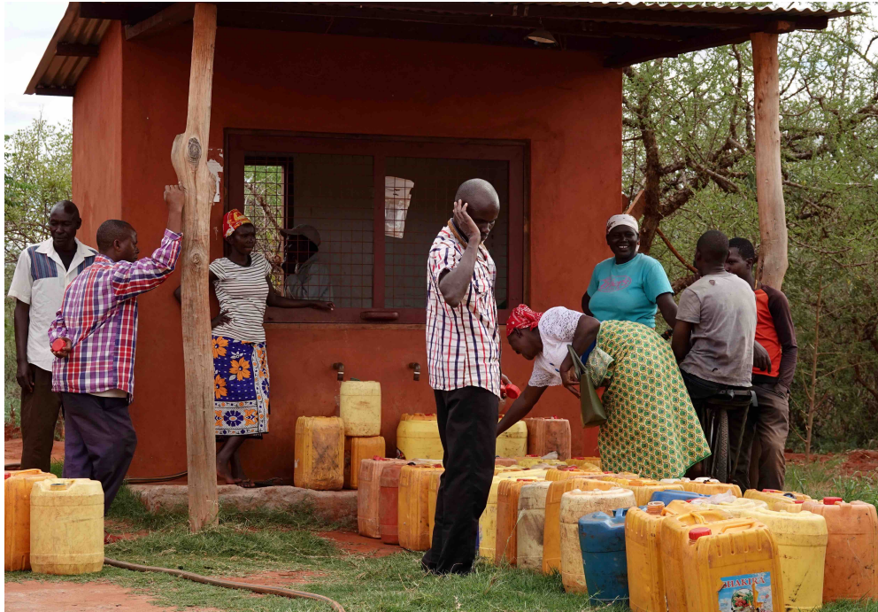
Photo shows Kamungi Conservancy community members drawing water in Ngiluni village on 28 th May 2019.

This water project is a Tsavo Trust initiated project in partnership with Kamungi Conservancy.