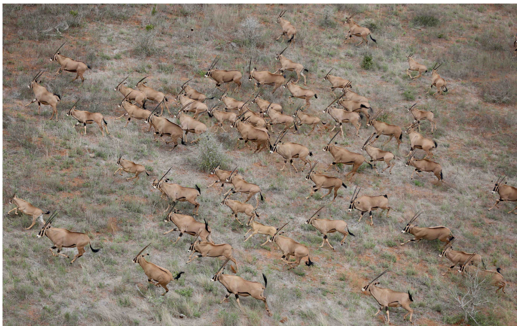
Photo, taken on 7 th May 2019 in TENP, shows a magnificent herd of over 58 individual Fringe Eared Oryx ( Oryx beisa callotis ).

This herd is showing good signs in that the herd composition contains young, sub adults and adults. In certain parts of Tsavo there are healthy populations of Oryx.