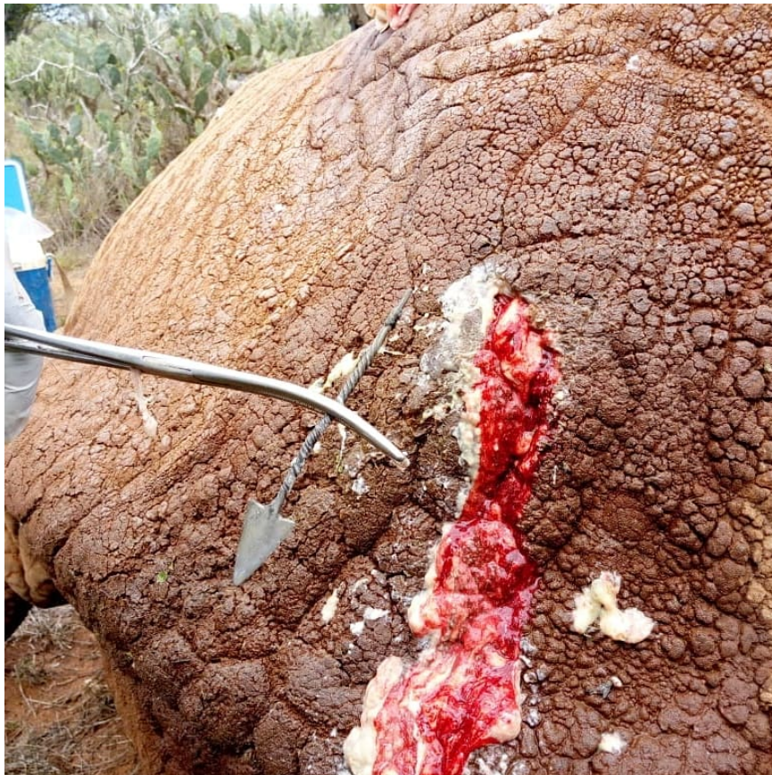
Photo shows removal of poisoned arrow from an immobilized elephant on southern boundary of TENP on 21 st May 2019.

This was 1 of 3 elephants to have arrows removed on the same day. Tsavo Trust’s Tembo 1 team located these elephants and called in the KWS Tsavo Vet Unit who acted swiftly.