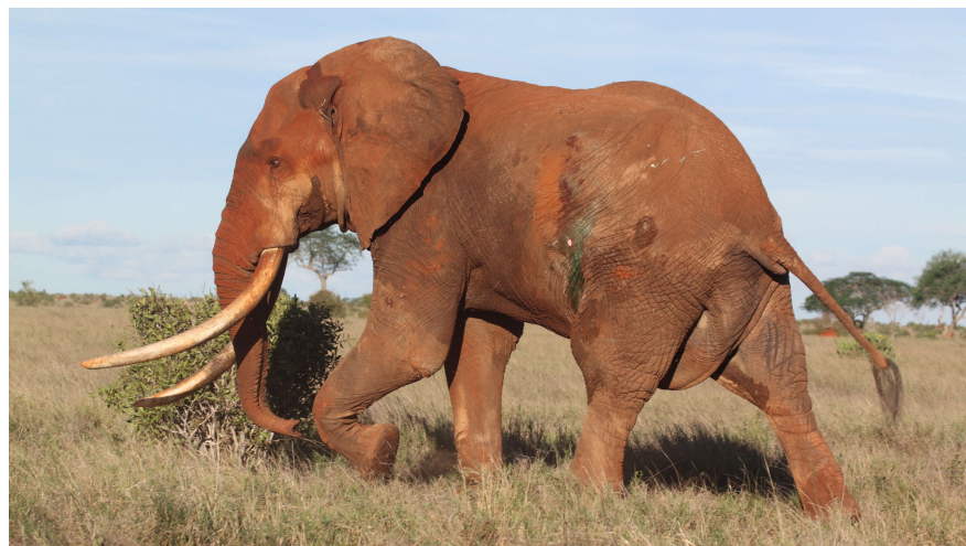
Photo shows Tusker coded as WS1 up on his feet having just had a poisoned arrow removed from his left flank on 10 th May 2019.

Close working relationship between KWS and Tsavo Trust (aerial and ground units) is without doubt adding to elephant security / safety of the big Tuskers and other elephants in Tsavo through meaningful and joint teamwork.