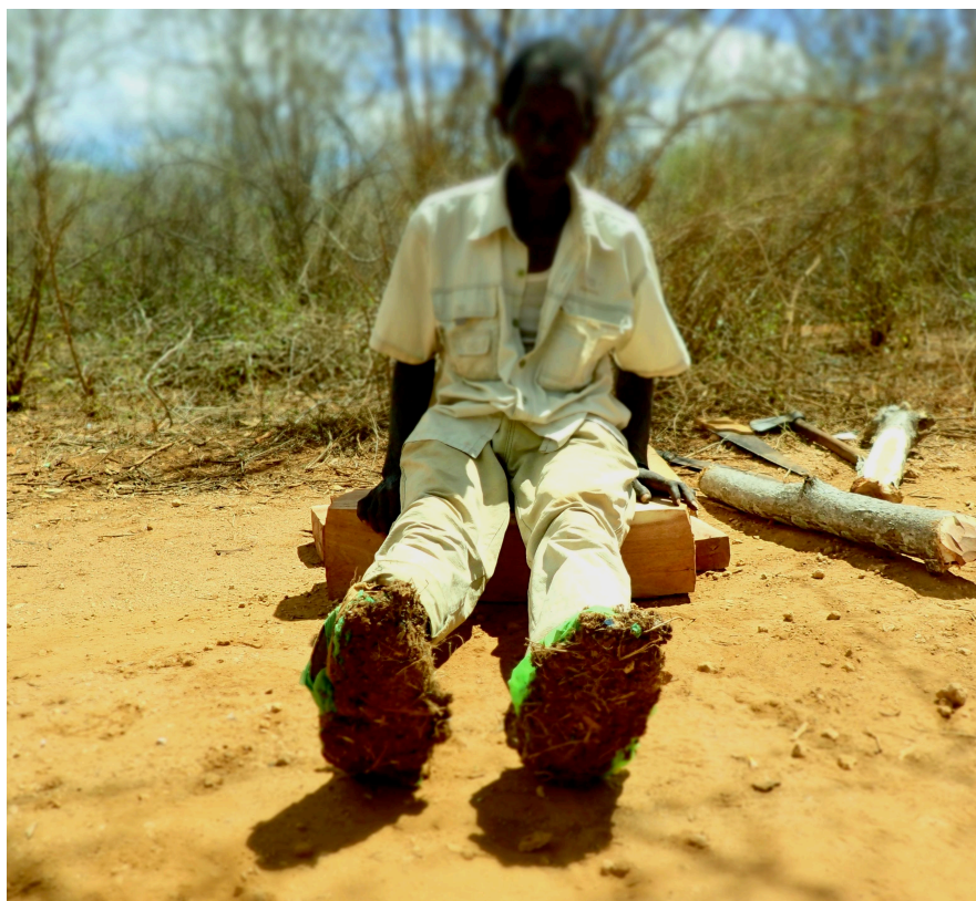
Photo shows an arrested hardwood / bushmeat poacher on 23 rd May 2019 within Tsavo Triangle.

It was very interesting to note the ingenious improvised shoes this poacher wore to conceal his tracks. They were made from dried sticky burrs stuck onto plastic bags tied around his feet (as shown).