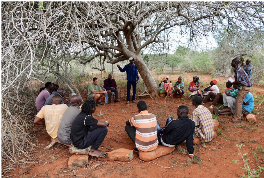
Photo shows a community baraza (meeting) at Shirango Conservancy near the remote Dabaso village on 30 th May 2019.

Various discussions were held regarding the imminent water project, elephant poaching's, bushmeat poaching and more.