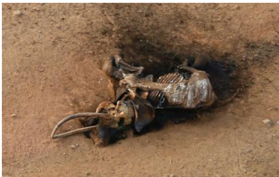
Photo shows the fresh carcass of iconic Cow Tusker called VOI (code F_VPL) taken on 7 th August 2017 in TENP. She sadly died naturally of old age. On the positive side, this is a very rare occurrence in today's elephant world to live to a ripe old age and die naturally of old age. Could the Big Tusker Project have played a part in this through its daily activities?