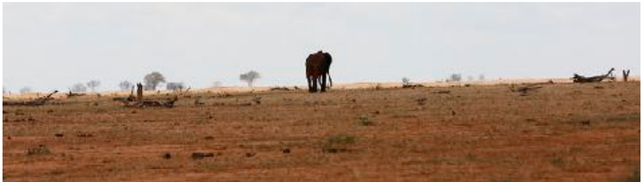
Photo shows newly identified emerging Tusker coded HA1 on 21 st April 2017. Given just a few more years of life, this bull will certainly become a Super Tusker. Tsavo is blessed with a strong gene pool of such magnificent elephants.

Photo shows newly identified emerging Tusker coded as HA1 on 21 st April 2017, walking away in a desolate part of TENP