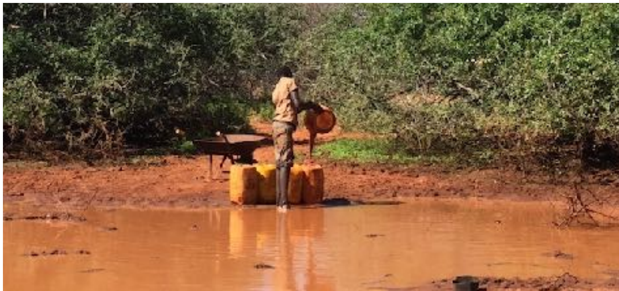
Photo below shows clearly how urgent the need is for the people of Kamungi Conservancy to enjoy clean water. Here water is being collected from a dirty water hole used by livestock and wildlife. The new water project put in place by Tsavo Trust will go along way to give this community clean and healthy drinking water, something they have never enjoyed before.